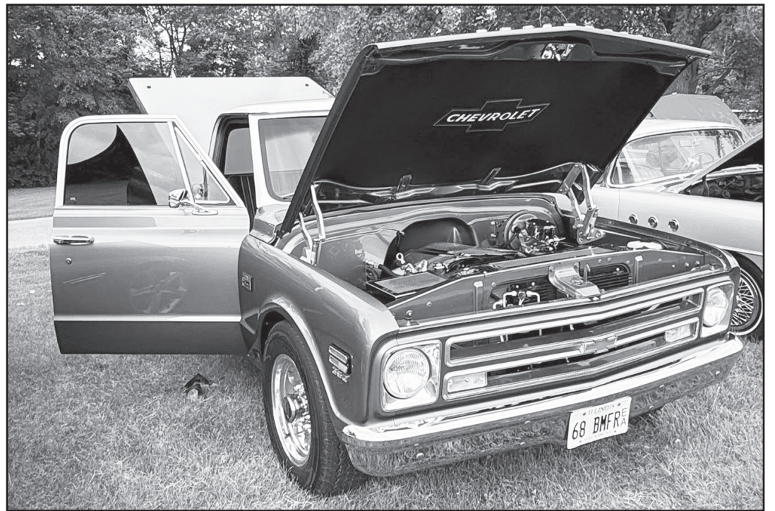
Best of Show older than 1985-1968 was a Chevy C20 Camper Special. More photos on page 4B

“The achievements that were celebrated today were not accomplishments by individuals working alone, but instead a collaborative efforts of our entire staff working together toward a common goal.”