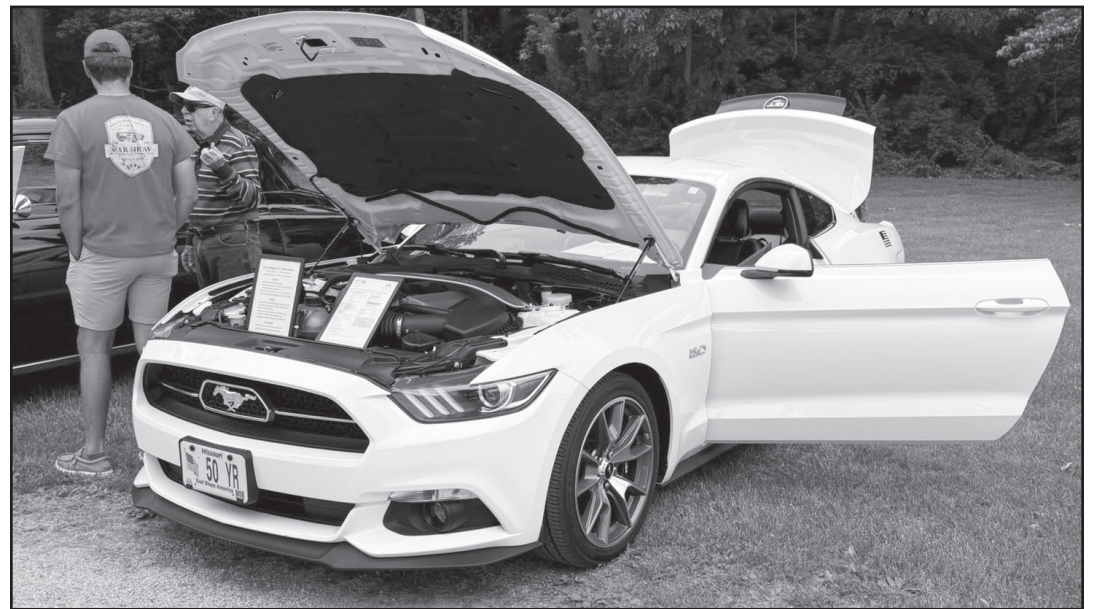
Best of Show years 1986 to Present was a 2015 Mustang 50 yr limited Edition.

The Benld Italian-American Days would like to recognize and thank Kravanya Funeral Homes for sponsoring the commemorative tees and dash plaques.